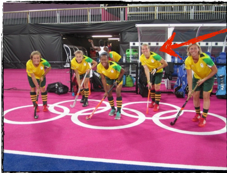
That's me at the London 2012 Olympics

Well let me tell you. The first reason is because I have achieved what most people only dream of - I have represented my country and played as an international hockey player. I achieved this despite never making a junior national team and while living on another continent, 6000km's away from my home country.